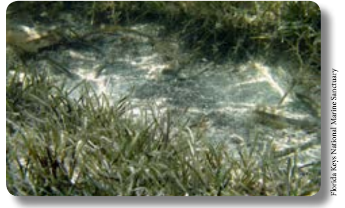
Seagrass scarring caused by motorboat propellers impacts the integrity of seagrass beds. "Pole and troll zones" can be created to reduce additional propeller scarring to seagrass communities in South Florida.